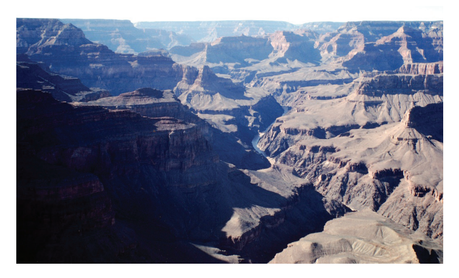
Figure 1.1 Grand Canyon (from near Powell Memorial)

Any discipline has concepts that are key for its progress. For geomorphology these need to be explicitly stated and consistently understood for what they are. We set them within the evolving history of geomorphology and the changing techniques and understanding that have been involved. This demonstrates the fashioning surges that have characterized the discipline and which complicate identification of those concepts which endure and which remain basic to the present and future study of geomorphology.